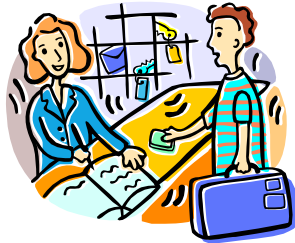
front desk agent